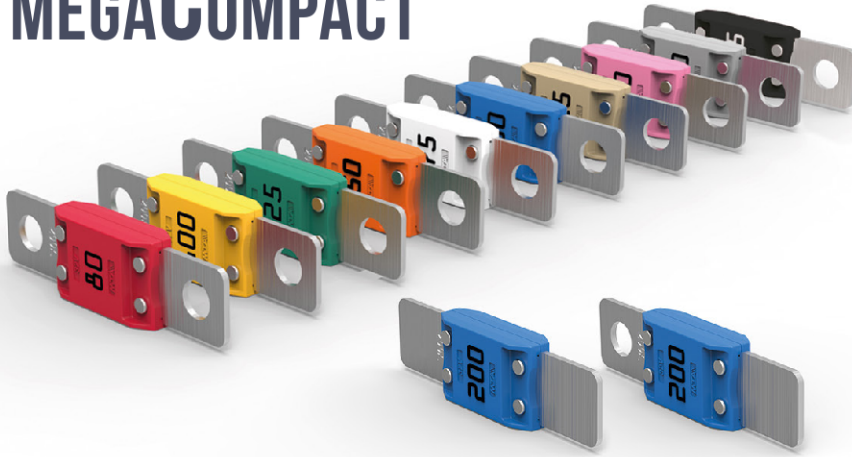
Clinged version available